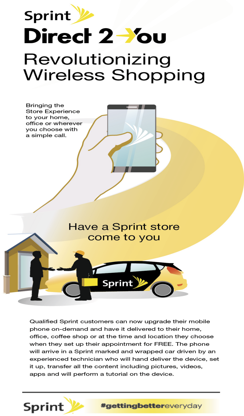
FIGURE 2 Sprint's Direct 2 You Brings The Store Experience To Home, Office, Or Wherever Customers Need It

Sprint Uses Digital Experimentation To Drive Rapid, Customer-Centric Innovation